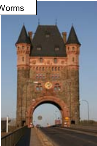
Entrance to Worms

Notice: While every effort will be made to adhere to the specifics shown in this or any other publication, certain circumstances may necessitate alterations, therefore; all fares, taxes, fuel surcharges, schedules, hours of arrival and departure and all other information contained herein are subject to change. Any unused portions of the package are non-refundable. Prices subject to currency fluctuations at final invoicing.