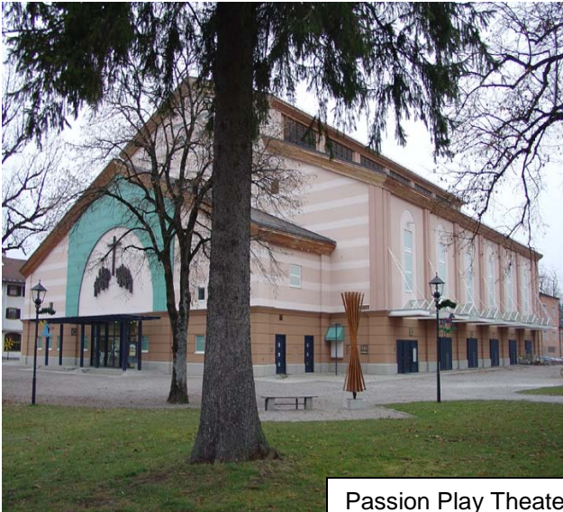
Passion Play Theater

Cancellation Policy: All cancellations must be in writing to Viking Travel Service, thus making cancellation effective on date of receipt. Unused portions of this tour package are non-refundable.