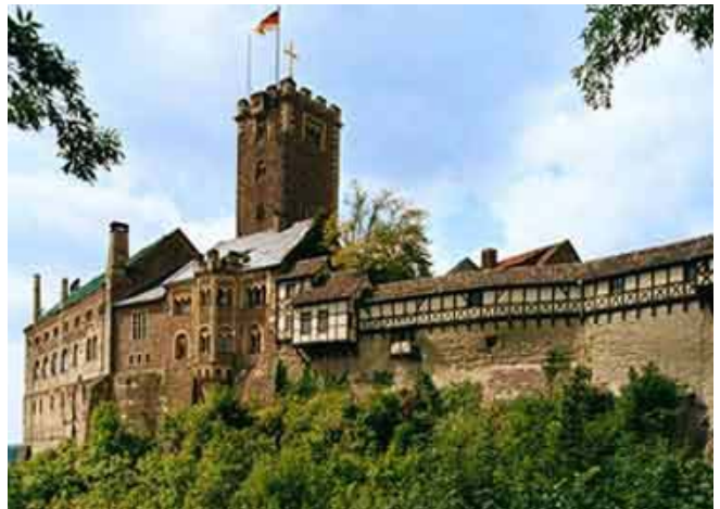
Wartburg Castle, Eisenach